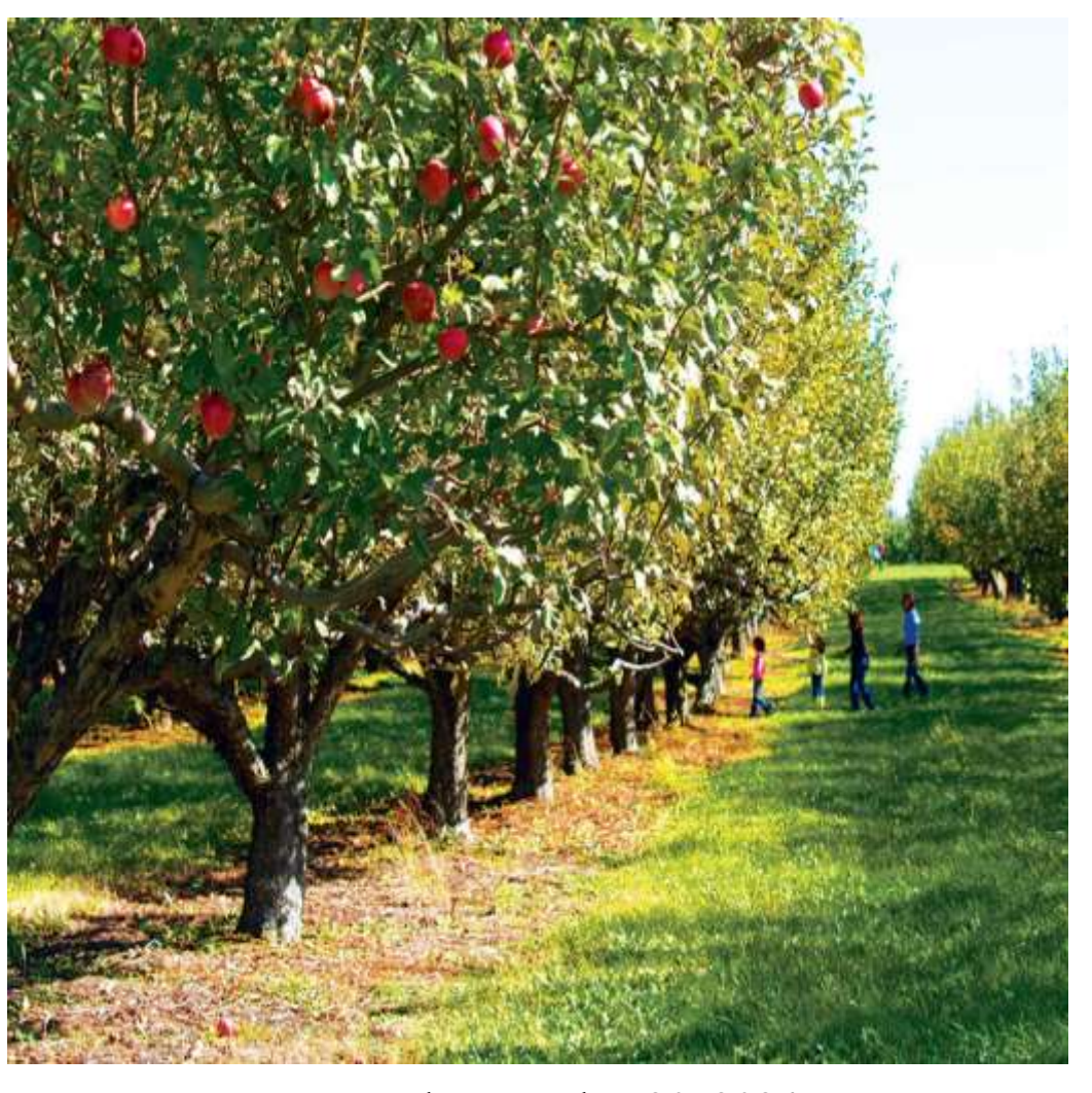
Sunday, October 20, 2024

75 McCutchen Street PO Box 472 Ellijay, GA 30540 706-635-2555